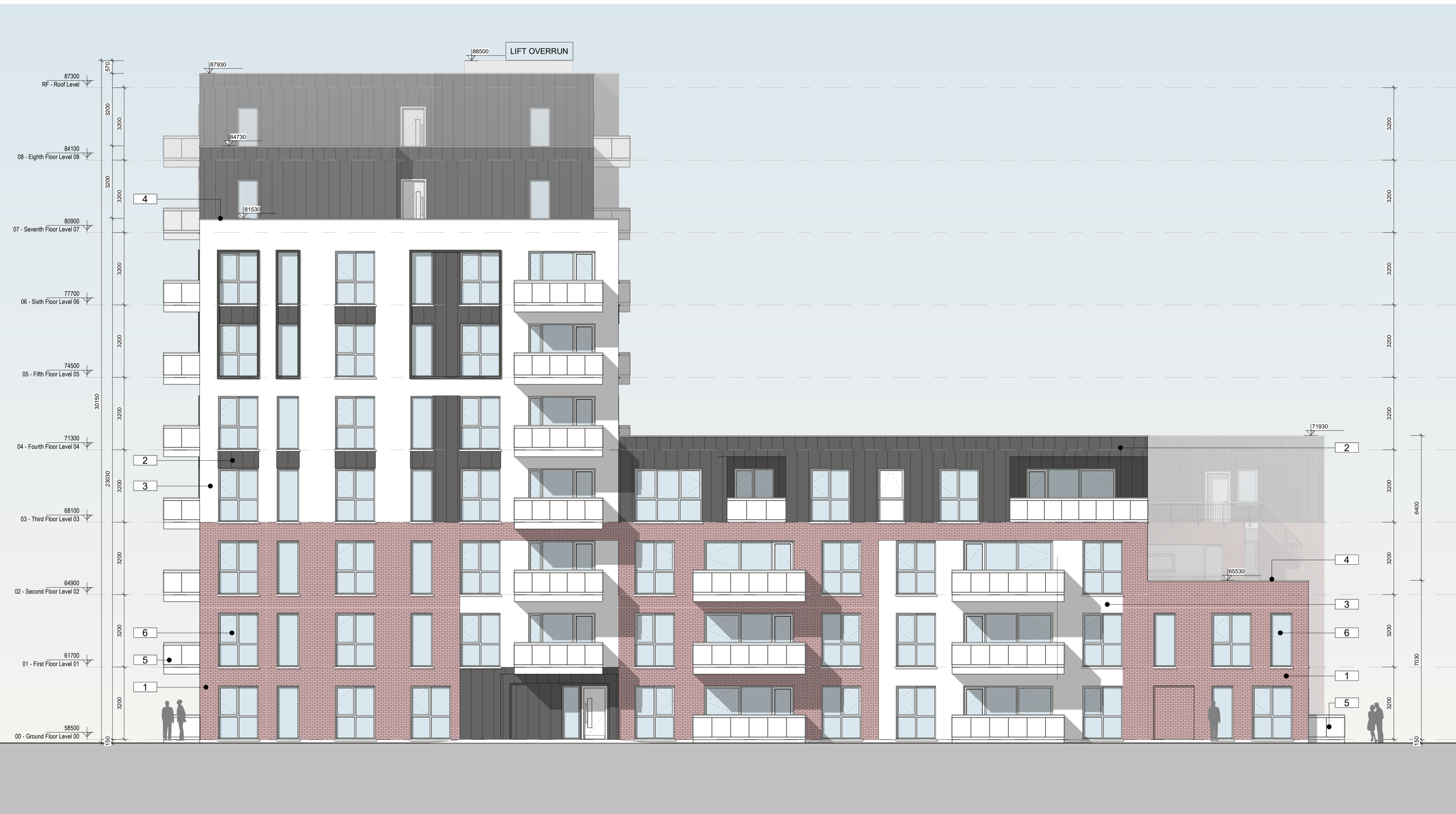
1 North Elevation 1 : 100

Please consider the environment before printing this sheet